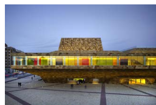
La Lotja Theatre and Conference Centre, Lleida, Spain Size: 37,500 m 2 Year: 2004 - 2010