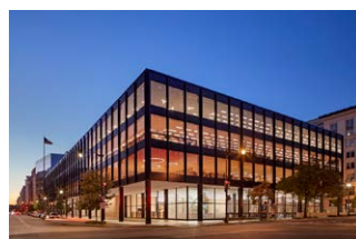
Martin Luther King Jr. Memorial Library, Washington D.C., US Size: 37,000 m 2 Year: 2014 - 2020