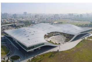
National Kaohsiung Centre for the Arts, Taiwan Size: 141,000 m 2 Year: 2007 - 2018