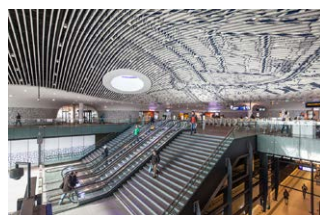
Municipal Offices and Train Station, Delft, NL Size: 28,320 m 2 Year: 2006 - 2017