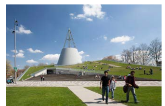
Delft University of Technology Library, NL Size: 15,000 m 2 Year: 1993 - 1998